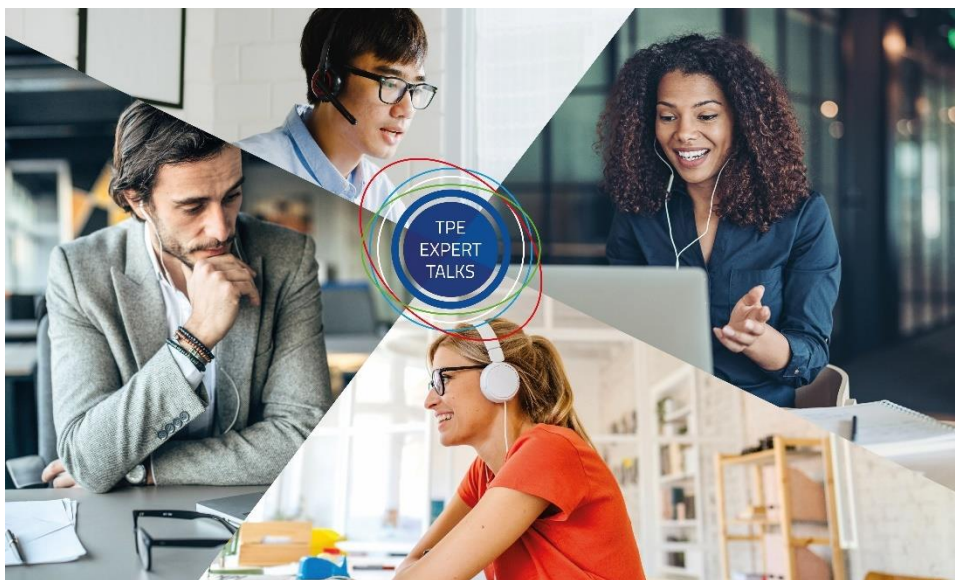
Image: TPE Expert Talks offer various formats for customers, partners and everybody interested in the industry and provide expert knowledge, tips and tricks free of charge.