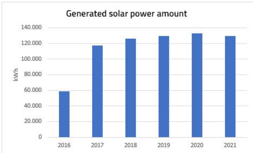
The development of KRAIBURG TPE's generation of renewable energies on the premises between 2016 and 2021 shows a positive trend.

Germany's electricity generating system is becoming more sustainable and the proportion of renewable energy consumed is growing. In 2021, KRAIBURG TPE was able to generate a total of 129.5 kWh emission-free power by expanding the surface of its photovoltaic system in 2017. This reduced the carbon footprint by 47.4 tonnes of CO 2 e.